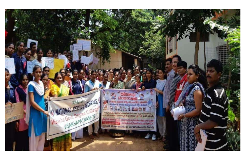
Rally on DomalapaiDandayatra - To create awareness amount people about breeding of mosquitoes and controlling methods to prevents mosquitoes.